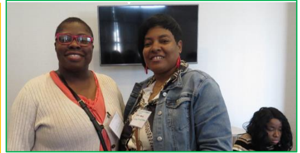
Excited business owners who secured their certificate of formation via TA from Spokes, Fresh Start Enterprise, LLC