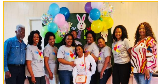
TOPIC - Town of Pickens Improvement Club

This collaborative effort seeks to improve the overall school and community environment, nurture positive character development, promote sound decision-making, and counteract negative behaviors and influences.