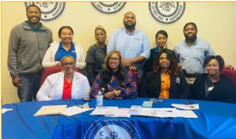
CSLC and Delta Health Alliance and other community health organizations