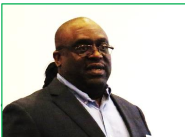
Cadence Bank officer explains what his bank does to help small businesses. Cadence was a sponsor.