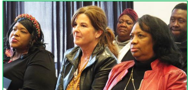
From right, SBA Mississippi reps listen to business presenters.