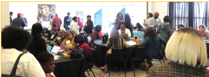
Attendees are heavily engaged in the technical assistance and networking session.