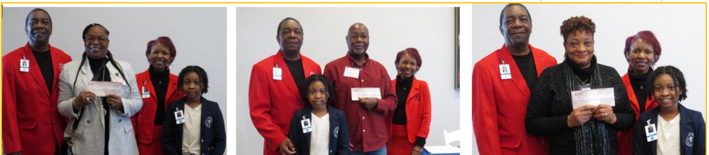
The three winners of the three small business mini grants display their awards made possible by various contributing donors.