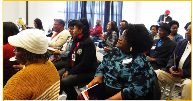
There was standing room only in the general session.

Small business owners and potential business owners shared that the TA conference was very beneficial to their businesses. (See adjacent and below highlights).