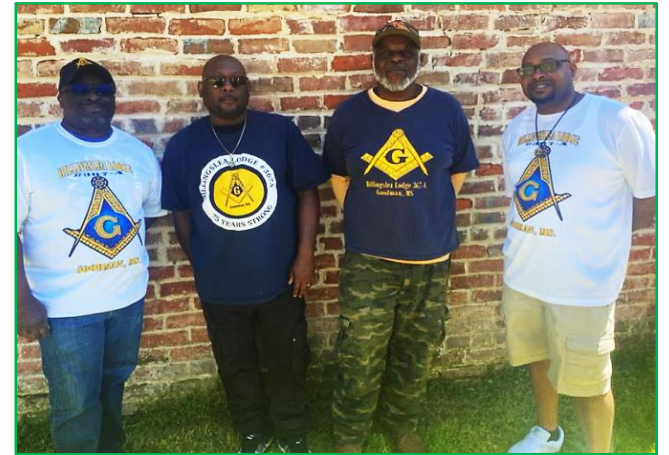
Billingslea Lodge 367-A Goodman, MS