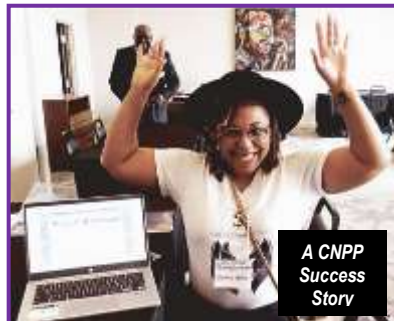
A CNPP Success Story