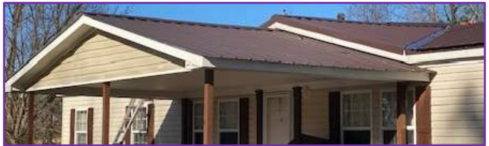
The New Roof