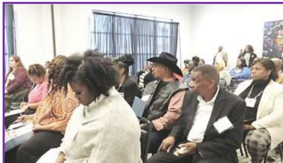
Attendees packed the general session as they were introduced to the lending fair's lenders and CSLC SBA CNPP spoke partners.