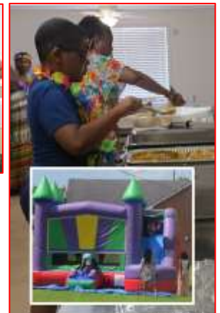
To the right, a former HIPHY Home Visitor and her nephew, a HIPHY graduate prepare their plates of the delicious foods. While in the inset photo, children are seen enjoying supervised fun activities on the bouncer.