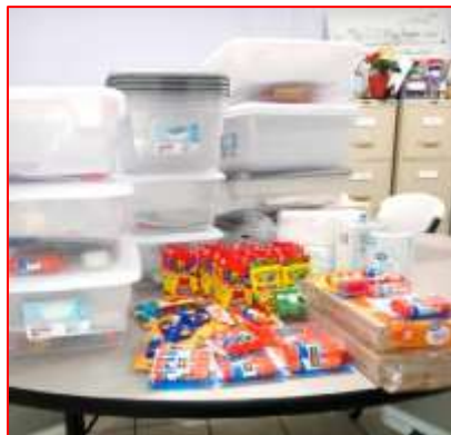
Some of the learning supplies purchased for HIPHY from the Community Luau Fundraiser.