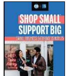
One of the SBS marketing