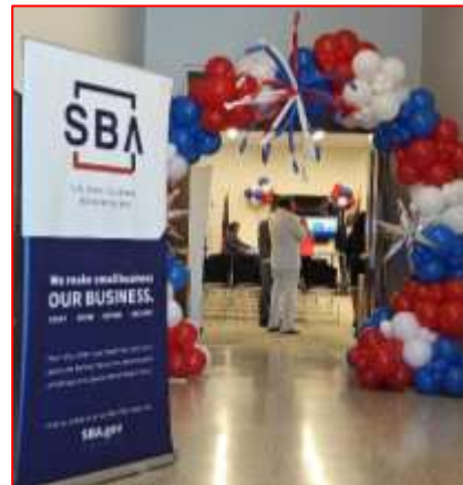
Colorful and festive entrance