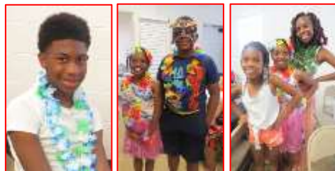
Above are some of the CSLC HIPHY graduates who returned to enjoy and support the Community Luau Fundraiser for the program.