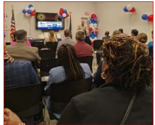
Attendees listen to Mayor Chokwe Lumumba as he brings greetings from the City of Jackson.