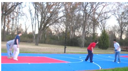
Community youth enjoy recreation on CSLC's Versa Court.