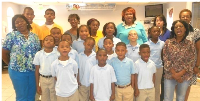
CSLC STARS students recite their CSLC Creed during a recent after-school tutorial. The students recite the creed each day they arrive at the center.