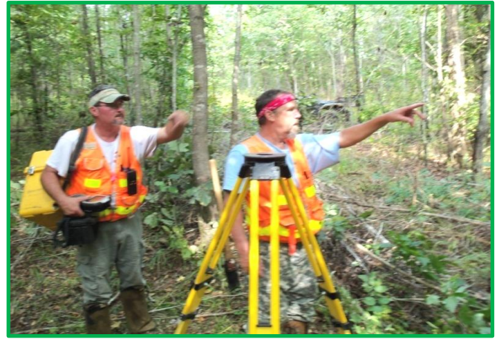
Above are two of the surveyors surveying the property to draw off the 15 acres designated as the site for the construction of the new homes.

Soon there will be some new single family homes available for purchase by low-to-moderate qualifying homebuyers, thanks to the CSLC-EDGE grant.