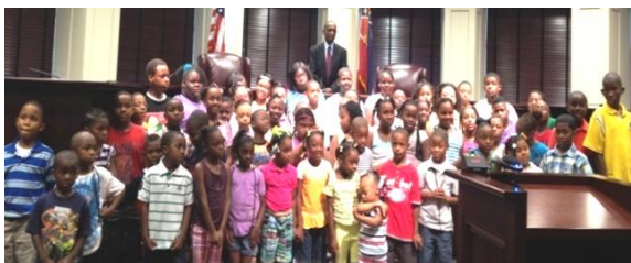
Summer STARS students visit Supreme Court building in Jackson, Mississippi.

I am somebody I am special I am unique I have purpose, goals, gifts, talents, and skills. I can do all things by setting goals, working hard, and believing in myself. I am wealthy. I am successful. I am worth more than my weight in gold. I am somebody!