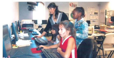
STARS after-schoolers use computers.